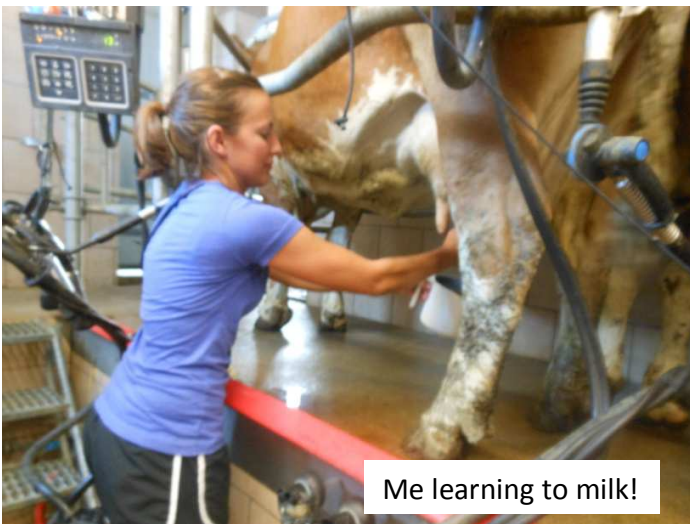
Me learning to milk!