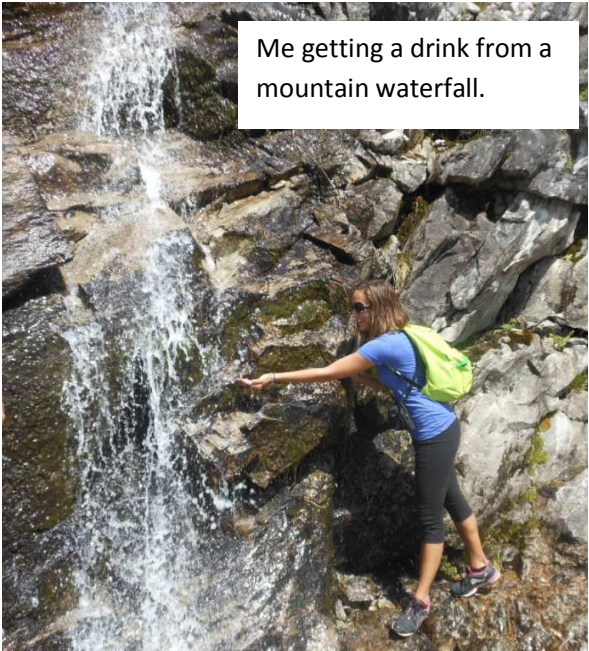
Me getting a drink from a mountain waterfall.