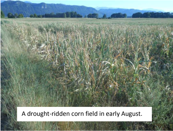
A drought-ridden corn field in early August.