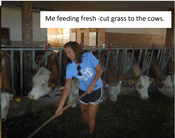
Me feeding fresh -cut grass to the cows.