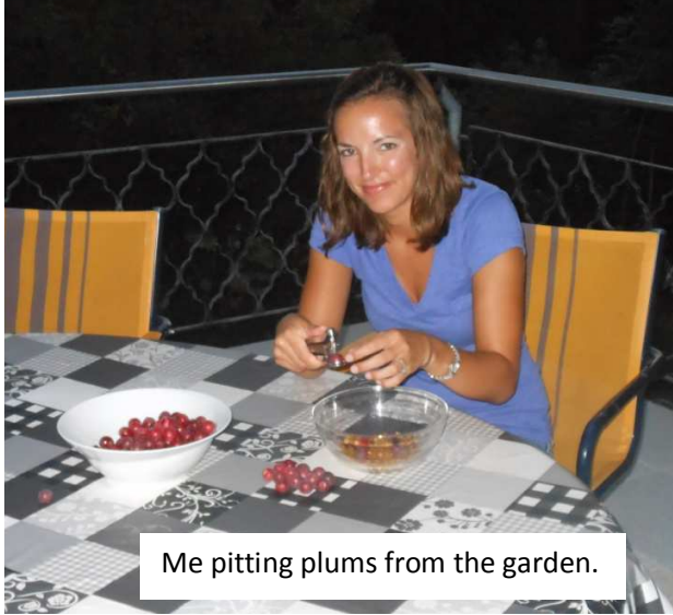
Me pitting plums from the garden.